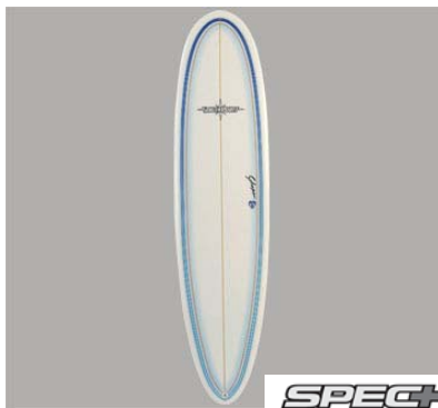
8'0'' Fun Shape #16650 "Bonga Perkins Pro model"

With east coast roots and tenure in Hawaii, Carl Shaper has been perfecting this "Mini-Tank" design for three decades. It paddle and surfs fast, with low entry rocker that provides great wave catching ability. Bonga's worked with Carl Shaper to maintain a balanced design with enough nose width to ride from the front, that remains neutral enough to be ridden on the tail as well.