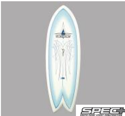
5'10'' Retro Fish #15545 "Schaper / Logreco Pro model"

Dieser mittelgroße Fish ist eine hervorragende Ergänzung für deine Boardauswahl. Klassisch in der Erscheinung, sorgt eine moderne Rockerlinie und weiterentwickelte Templates für mehr Vielseitigkeit und Spaß als man es von den ursprünglichen Fishes her kennt. Ein großartiges Board, das auch für Surfer bis zu 80kg genügend Auftrieb bietet.