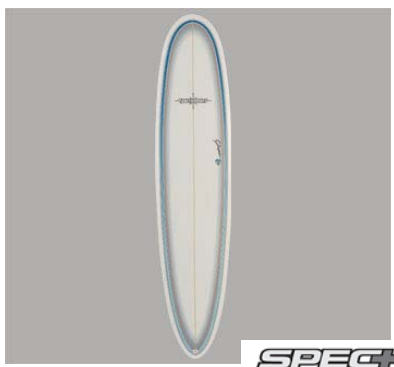
9'1'' Longboard #11836 "Bonga Perkins Pro model"