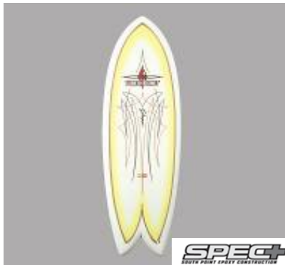
5'7'' Retro Fish #15544 "Schaper / Logreco Pro model"

Das 5'7" Logreco vereint alte und neue Shapemerkmale zu einem klassischen Fishboard mit moderner Performance. Verwendet werden aktuelle Rockerlinien mit einer Outline die mehr „Curve“ besitzt als traditionelle Fishes. Diese Kombinationen ergeben ein schnelles und drehfreudiges Board, welches in unterschiedlichsten Bedingungen einsetzbar ist.