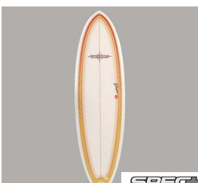
6'6'' Fun Shape #11910 "Bonga Perkins Pro model"

Waiting to go off! This Board was designed to be super fun in a variety conditions. It is insanely fast, loose and pickes up waves like a magnet. While Bonga is Primarily Recognised as a Longboarder he rips on short boards, too! He has helped to create a board that's all about increasing your fun factor and wave count.