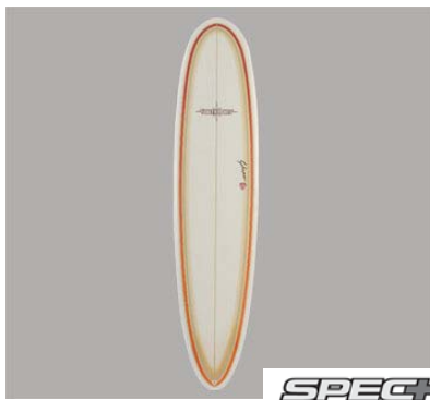
8'8'' Longboard" #15552 Bonga Perkins Pro model"

The smaller version of the renowned 9'1". For the advanced surfer it is the refined longboard needed for the big days or on fast, down-the-line point breaks. Additionally it's foil and reduced outline make it perfectly suited as the mainstay longboard for riders under 75kg. a great design that performs in a multitude of conditions.