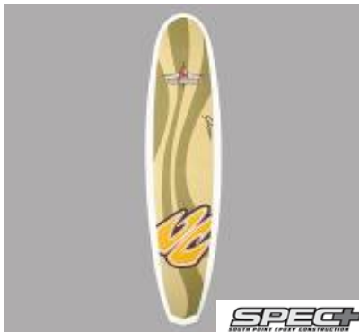
10'0" Stand Up Paddleboard #15540 SCH/BONGA

Bonga's high-performance, wave riding stand-up design. The most noticeable feature of the design is the step-deck and rail. This unique configuration creates a full volume board with disproportionately thin rails. The thinner rails allow the board to bottom turn, carve and fit in the pocket much like a standard longboard. Already proven A contest winner, it's designed as a dedicated in-the-surf Stand-up. Not a beginner board !