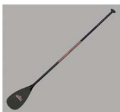
Stand Up Paddle #14602