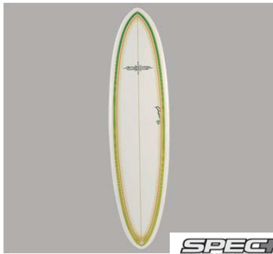
7'6'' Fun Shape #16649 "Bonga Perkins Pro model"

A great wave catcher and personal favorite that's been refined with Bonga's feedback. Designed to cover a lot of territory, it works unreal in beach break and handles fun-size conditions in Hawaii. Depending on where you live and surf, it's quite possible a one board quiver.