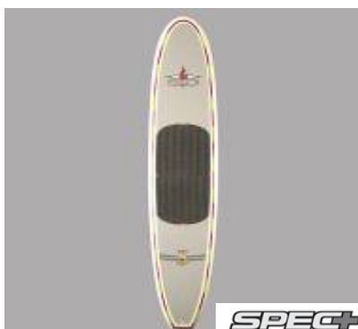
11'6" Stand Up Paddleboard #15517 TIMP/KALA

Direct from the leader of the stand-up resurgence is the 11'6" Kalama Timpone. Based on Dave's all-around, everyday stand-up's comes a design with tremendous versatility and performance. It's hard to envision a better board for flat-water, surf or coast runs. Packaged in a size that will accommodate first-timers and appease veterans, this one-board-fits-all stand up is a must for your quiver. The Kalama model comes complete with full, dual density EVA deck, Material: 100% Carbon Paddellänge: 218cm lang Paddelfläche: 23 x 45cm Schaftdurchmesser: 31mm Gewicht: 950g