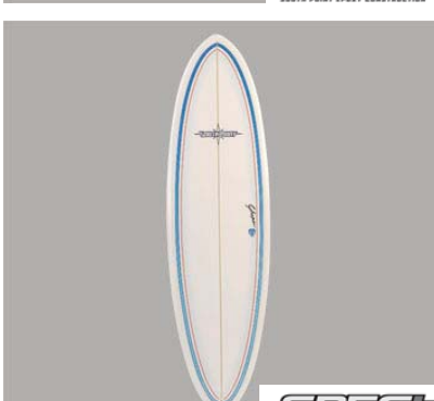
6'10'' Fun Shape #16647 "Bonga Perkins Pro model"

A Modern Hybrid design with an incredible range. It's a "sleeper" that is waiting to get off ! The fuller Outline allows you to pick waves off almost at will in crowded conditions. Contemporary Rockers make it ride like a shortboard and with Bonga's insight we have created a board that works unreal for both big and small riders.