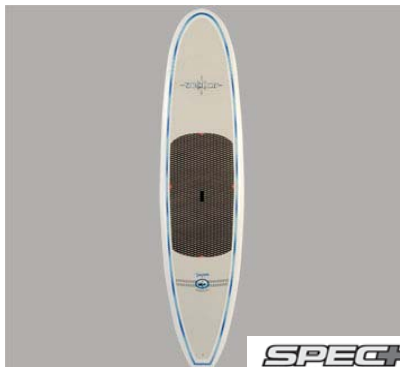
10'6" Stand Up Paddleboard #16654 TIMP/KALA

Developed to be the most versatile S.U.P. available. Advanced paddlers will find a board that allows them the highest level of performance. Featuring a single concave bottom with accelerating tail rockers, creating smooth projection off the bottom. The rails are full at mid promoting stability, then taper to a relaxed profile in the tail. This allows you to effortlessly tighten the radius of the turn or hold an old-school trim line. Simply a great in the surf S.U.P.