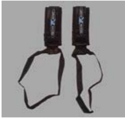
TekknoSport Leash for Fins #13422