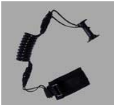
Bodyboard Leash STANDARD #13420