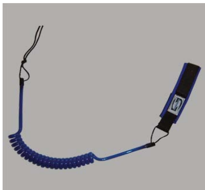
Bodyboard Leash SURFSTER #13419