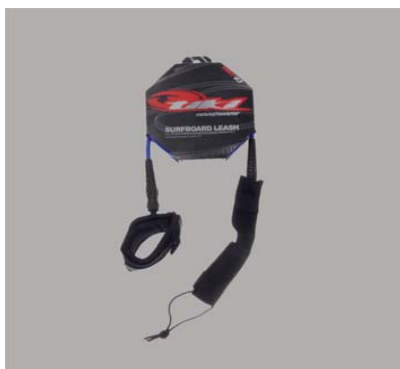
Tiki Bodyboard Leash Streight #11082