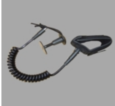
Bodyboard Leash PRO #13421